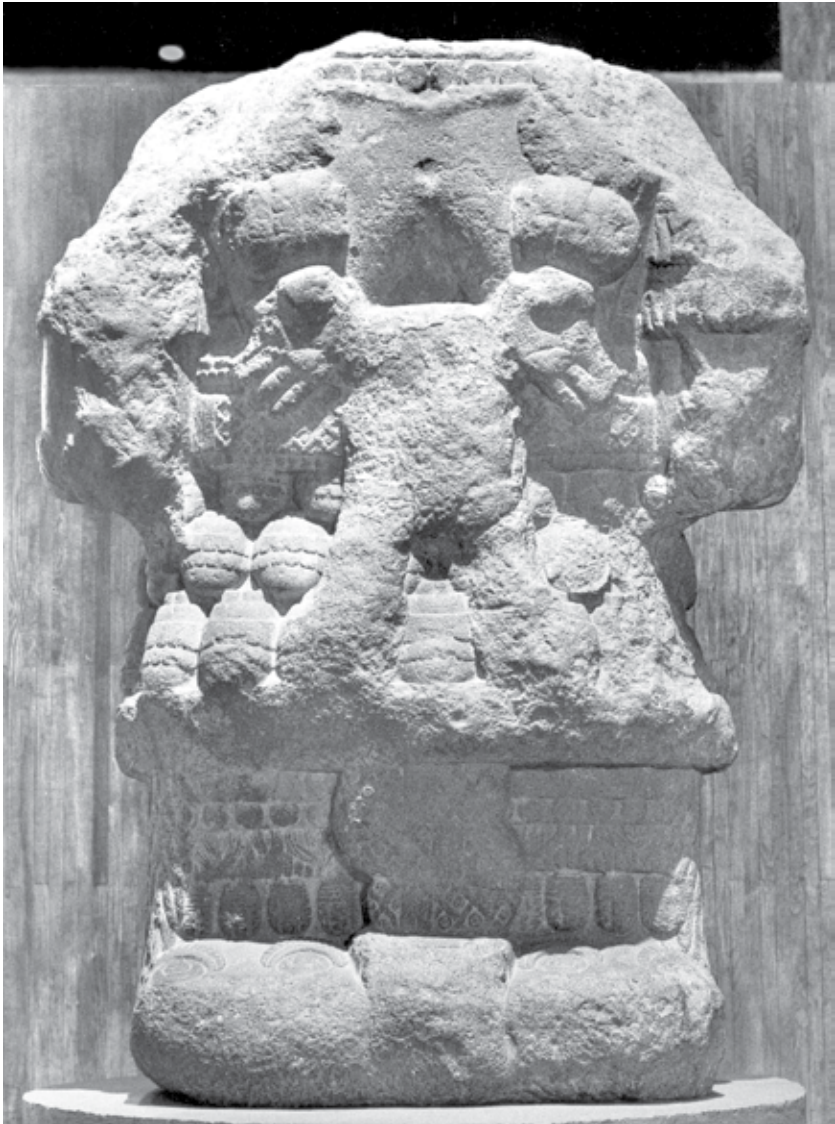
Figure 3. "Yolotlicue," Museo Nacional de Antropología e Historia, Mexico.