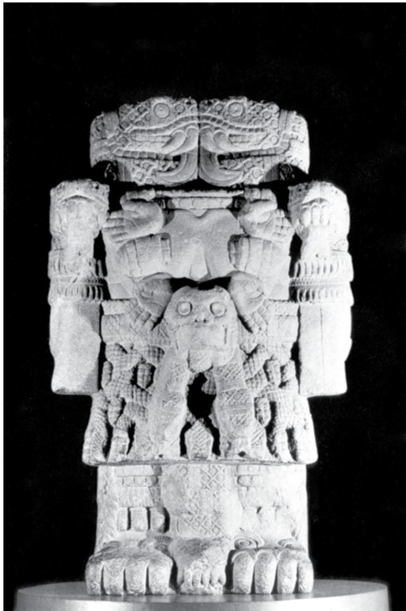
Figure 1. "Coatlicue," Museo Nacional de Antropología e Historia, Mexico.