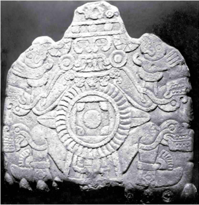
Figure 7. Relief on the underside of the Coatlicue statue, Museo Nacional de Antropología e Historia, Mexico.

was born. The date 13 Reed would have been entirely appropriate on statues representing ancient women who gave their lives in the year that the fifth and present sun was put in motion.