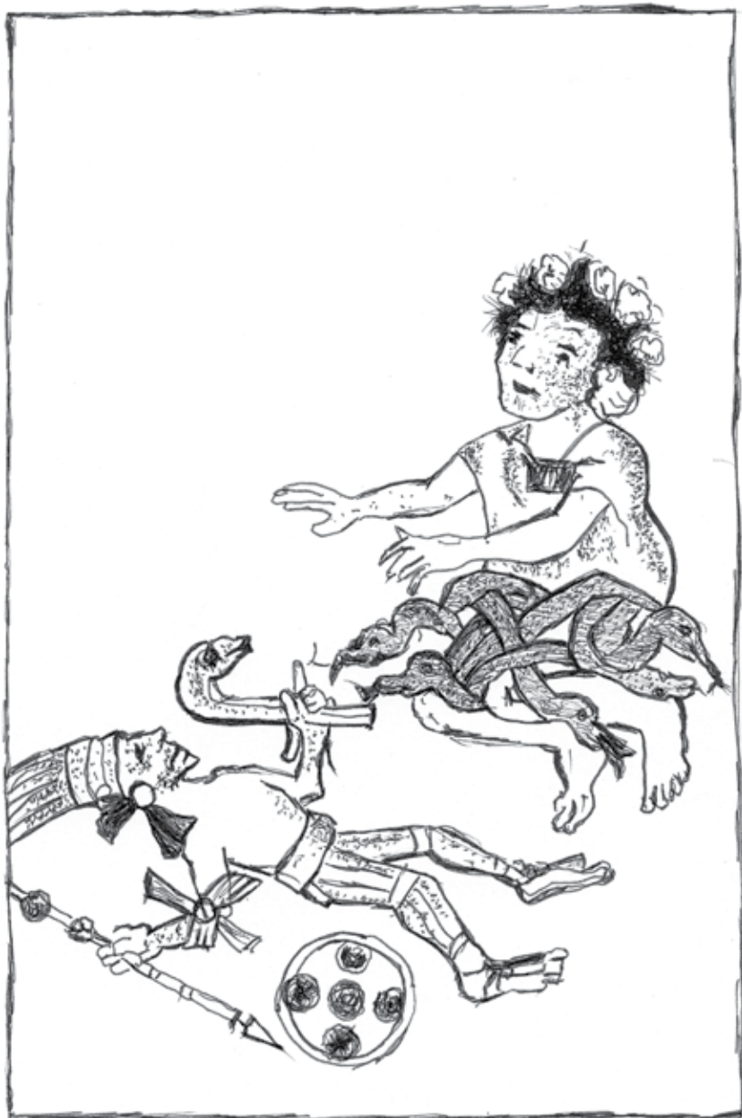
Figure 2. Coatlicue having given birth to Huitzilopochtli. After Sahagún's Códice florentino [Florentine Codex], Book 3, folio 3v. Drawing by the author.