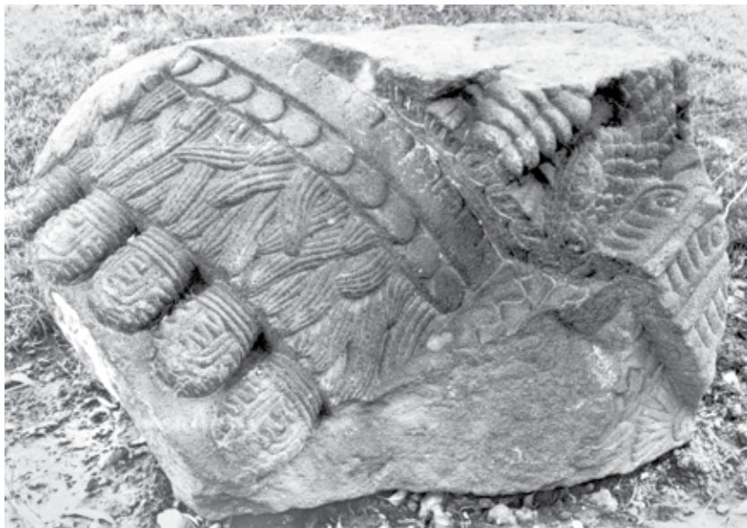
Figure 5. Fragment of stone statue, Museo Nacional de Antropología e Historia, Mexico.

This reading of the Coatlicue statue draws from colonial accounts of a very different episode in Mexica mythohistory. One of these appears in the anonymous Historia de los mexicanos por sus pinturas , thought to be one of the earliest colonial documents to survive the conquest (García Icazbalceta 1891: 235, 241). There it is stated that long ago, when the earth was still in darkness, the god Tezcatlipoca created four hundred men and five women “in order that there be people for the sun to eat.” The four hundred men died four years later, but the five women lived on for another twelve years before dying, according to the text, on “the day the sun was created.” 3 Although it is not explicitly stated, the implication is that it was the women’s voluntary deaths that made it possible for the sun to be born. This is supported by a similar account in the Leyenda de los soles (Bierhorst 1992a: 149). There the sun is said to have been unable to move. The situation was resolved, according to the Leyenda , by the collective self-sacrifice of five deities, two of whom were male and included Huitzilopochtli. The name of one of the three females was Xochiquetzal, “Precious Flower,” while the other two were named Nochpalliicue, “Red-Her-Skirt,” and Yapalliicue. 4