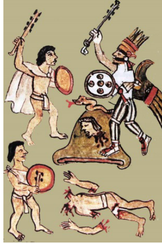
Image 2: the Florentine Codex depicting Huitzilopochtli in battle with the brothers in Coatepec.

sky where it became the moon, so that his mother would be comforted in seeing her daughter in the sky every night. Then, Huitzilopochtli took on the four hundred brothers and killed each one of them.